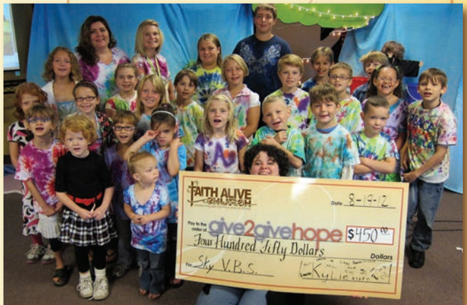
VBS kids from Faith Alive Church in West Branch, Mi. were thrilled to help poor children through a $450 donation to Give2GiveHope.

Alive Church in West Branch, Michigan, held a VBS fundraiser in August and donated $450 to Give2GiveHope. St. Joseph Catholic School in West Branch invited Give2GiveHope to present during "Catholic Schools Week" in February and raised over $200 toward Project Clean H2Ope water filters. We also received a $6,100 donation from Capilano Christian Assembly in Edmonton, Alberta, Canada from their church's Thanksgiving fundraiser.